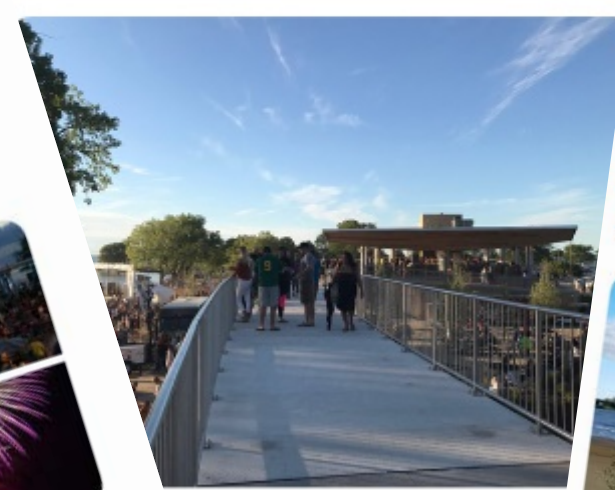
PM from Edgewater Beach